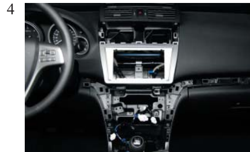
Place the replacement panel