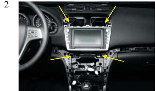
Remove the original radio. This is thighten by four screws