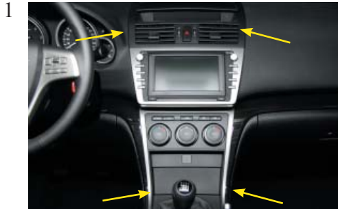
Remove the surrounding around the gear leveler. Remove the air shafts above the OEM radio.