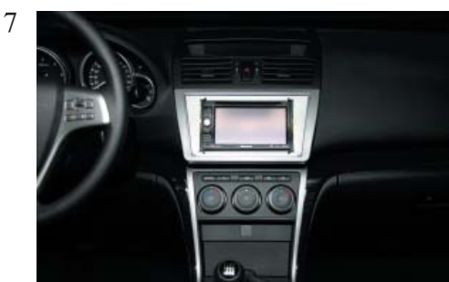
Place the new headunit