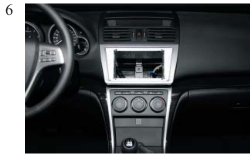
Place the oem panels back in reverse order.