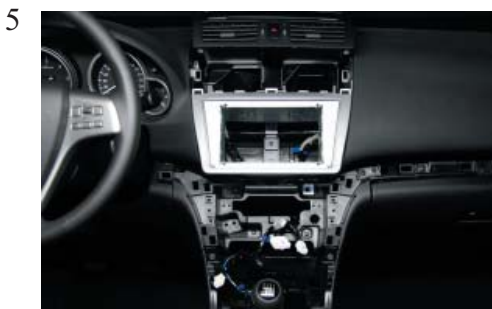
Place the metal bracket