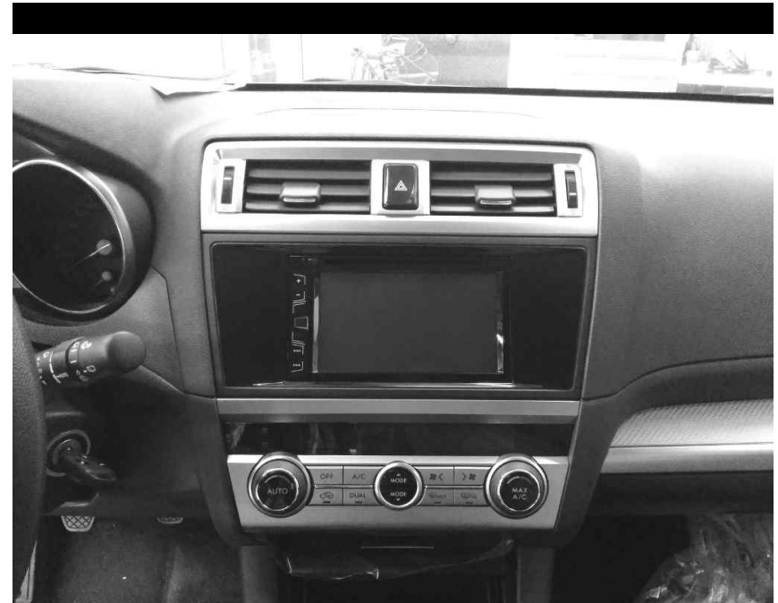
Double DIN Kit content