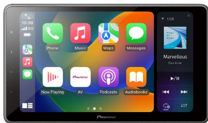
【"Apple CarPlay" split screen display】